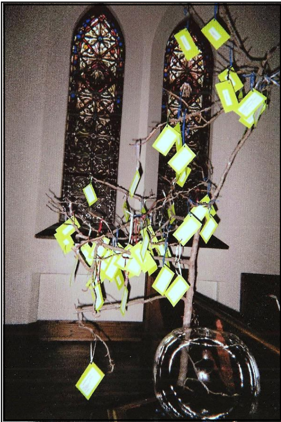
The Lent Giving Tree