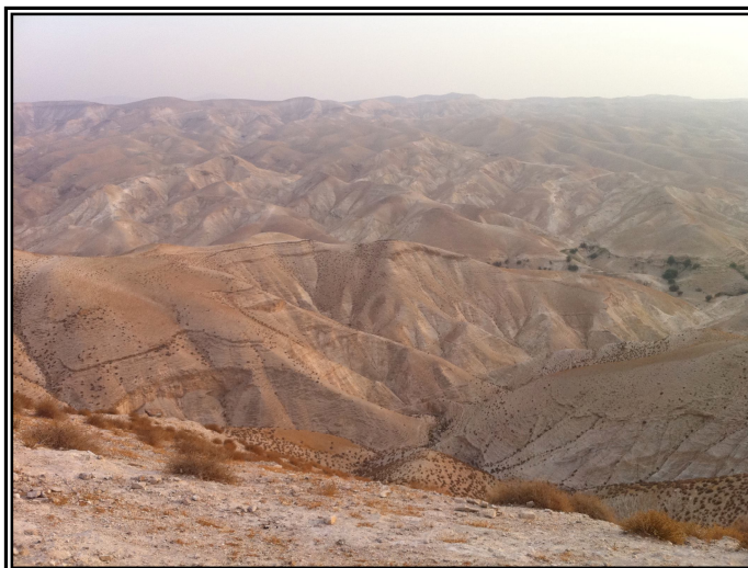
The wilderness of Jesus, as seen from a high place.

Where faith embraces reason and tradition