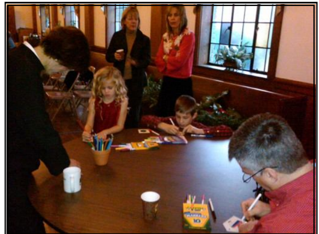
Jesse Tree Making - December 12, 2010

We raised $500.00! With donations from our children, parishioners, and other donors, we raised enough money to help two children. In the month of December the Operation Smile Program matches our gifts, so we will be helping four children! Great work Church School!